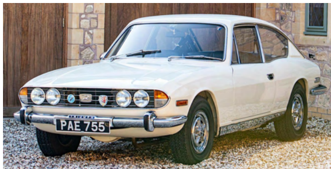
The sole surviving Stag fastback

During the late 1960s, during the development of the Stag, Triumph sent a body to Michelotti in Turin, Italy for modification. The design studio's craftsman fabricated the fastback top and sent the car back to Triumph for evaluation and consideration. Michelotti followed with a second prototype, while Triumph employees built a third.