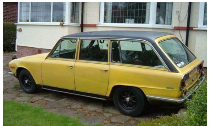
This one needs a little work...

Utilizing 2000 estates provided by Triumph, Lines and his crew grafted on the sports/GT’s front end plus the V8 engine, widened the rear flairs to handle wider wheels, added an electric sunroof installed by Bristol coachworks and upgraded the brakes. He built a total of 25 before Triumph cut off his access to the 2000 donor bodies but reportedly Lines followed up by modifying customer cars to Stag estate standard.