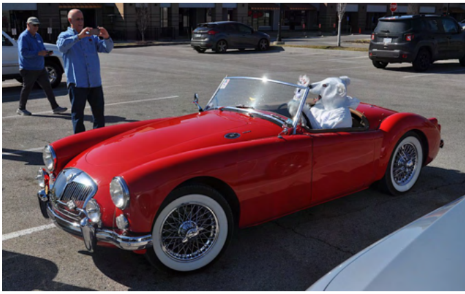
The Bear arrives...