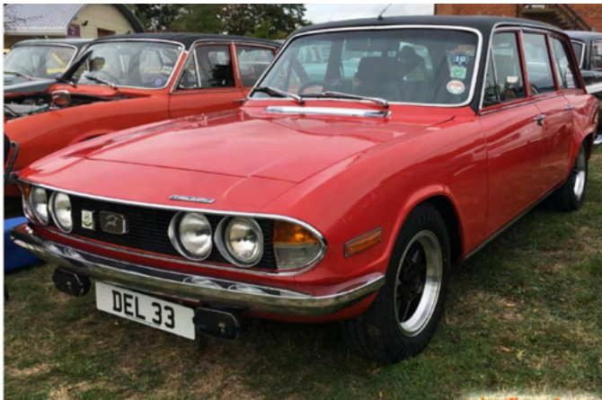
Stag Estate